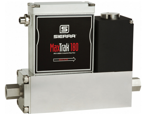
Figure 2: MaxTrak™ 180 Mass Flow Controller for CO 2 injection for beverage industry