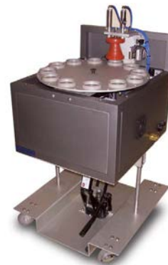
Twelve Station Automatic Filter Changer Tray