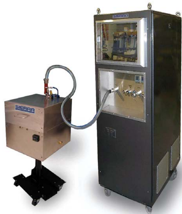
BG®3 attached to Automatic Filter Changer