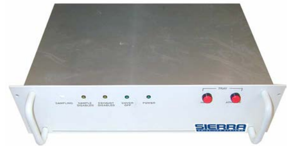
Rack Mounted System Controller