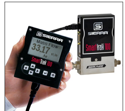
SmartTrak® 100 with Compad™ & Pilot Module