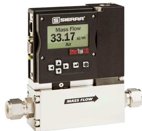
SmartTrak® 100 Digital Mass Flow Controllers for Gas Mixing & Blending

sierrainstruments.com/library/videos/massflow-versus-volumetric