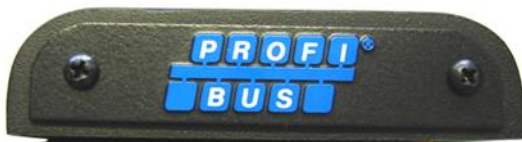
Figure 1: Unscrew dip switch access cover to access dip switches, remove cover.