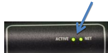
Figure 3: LED Status