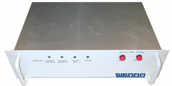
Rack Mounted System Controller