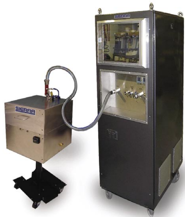
Model BG®-3 attached to Automatic Filter Changer