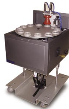
Twelve Station Automatic Filter Changer Tray