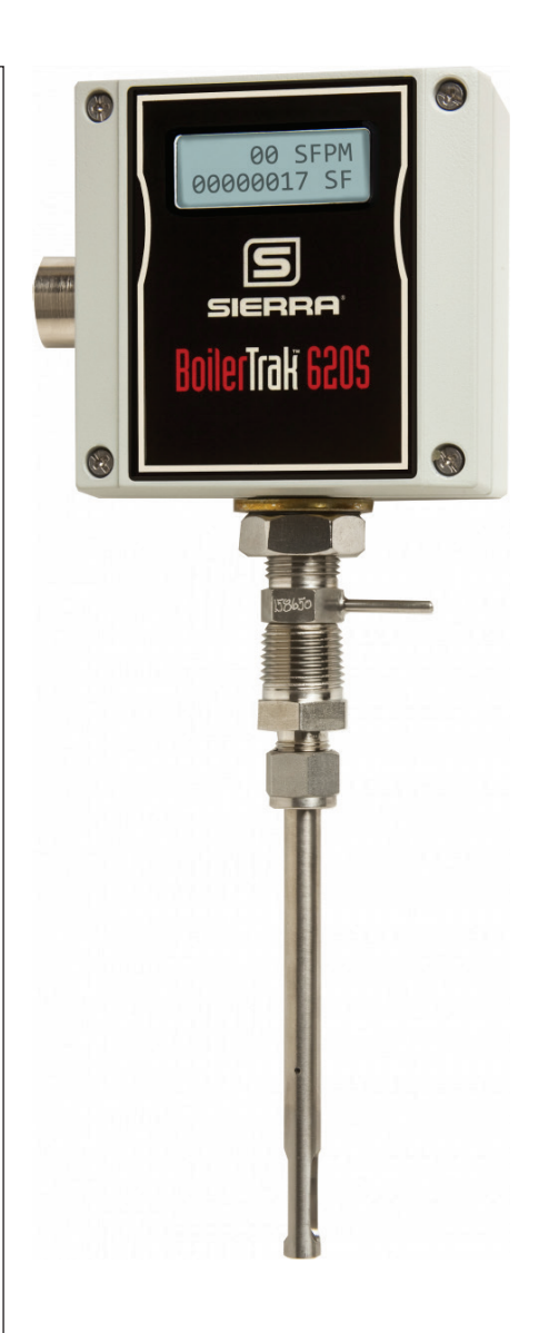
Figure 2: BoilerTrak™ 620S-BT Thermal Mass Flow Meter For Inlet Fuel Flow Measurement

To efficiently tune a boiler, three key measurements must be taken: air and fuel inlet flow, feed water flow, and steam output (See Figure 1).