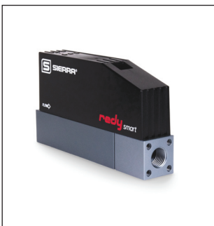
RedySmart™ / Industrial™