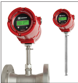
FlatTrak® / SteelMass®