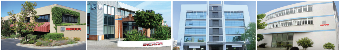
California / USA