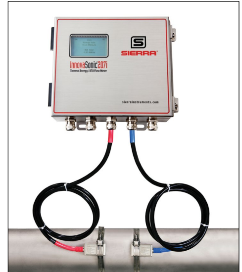
InnovaSonic ® 207i with Clamp-on Transducers